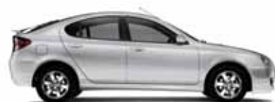
Genetic Silver (metallic)

** Total price including VAT o Option at extra cost