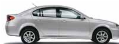
Genetic Silver (metallic)