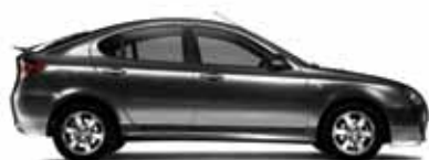
Onyx Black (metallic)