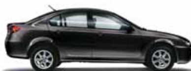
Onyx Black (metallic)