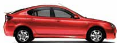
Chilli Red (solid)