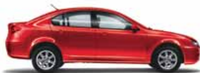
Chilli Red (solid)