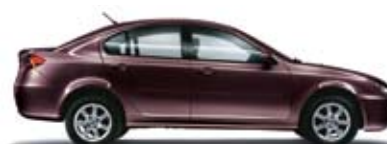
Blueberry Tea (metallic)