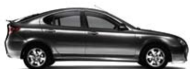
Nanbu Black (metallic)