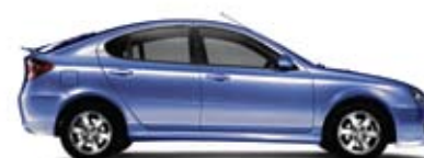
Passion Blue (metallic)