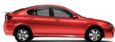
Chilli Red (solid)