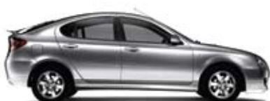
Steel Grey (metallic)