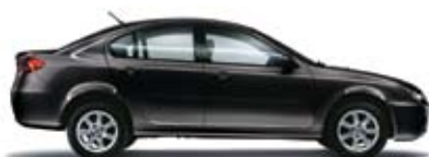
Onyx Black (metallic)