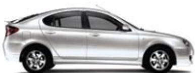
Iridescent Silver (metallic)