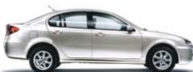
Iridescent Silver (metallic)