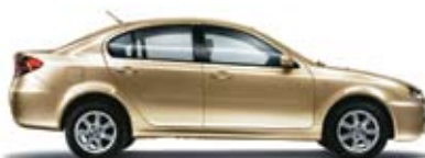
Light Metallic Gold (metallic)