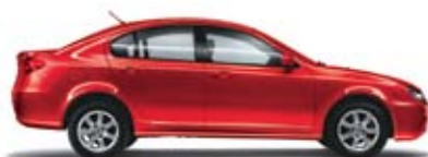
Chilli Red (solid)