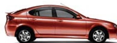
Energy Orange (metallic)